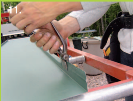
11 & 12: Fabricating a double male panel from a standard roofing panel.