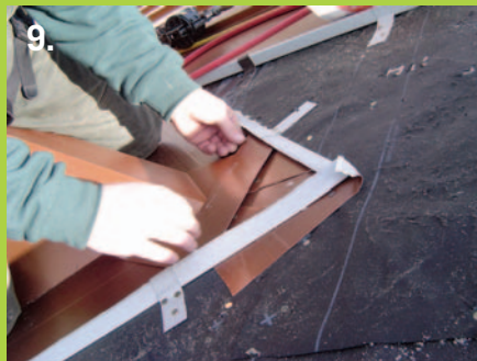
9: The bowtie cleat joins the two hems of the opposing valley just over the top of the ridge cap.

The final step is to install a "bowtie" cleat that joins the two hems of the opposing valley just over the top of the ridge cap. This cleat is applied over a 1-inch butyl tape or polymer sealant. (See photo 9.)