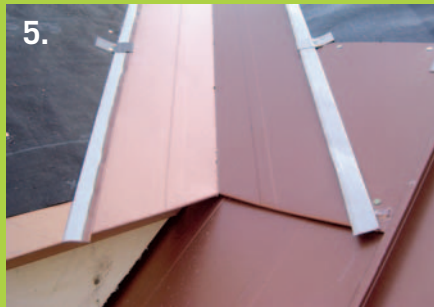
5: The valley should be hemmed around the drip edge or cleat at the bottom and connect evenly with the opposing valley at the top.