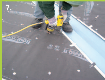
7: The clips for the valley are nailed in place.