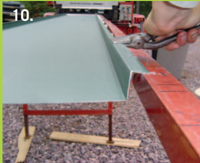
10: Fabricating a double male panel from a standard roofing panel.