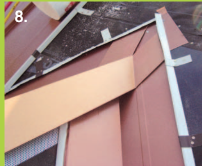
8: Here the ridge cap is fully installed under the hems.

through. This will eliminate the potential for leaving kinks or other defects in the finished product. (See photo 3.)