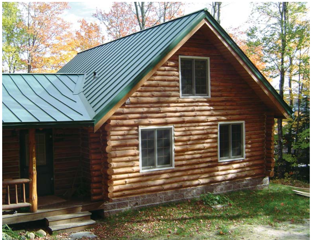
Figure 4. A standing-seam metal roof completes the job. The vent strip is inconspicuous.

At this point we're ready to put down underlayment and then roof. We always install standing-seam metal ( Figure 4 ), but there's no reason composition shingles or some other roofing couldn't be installed over this buildup.