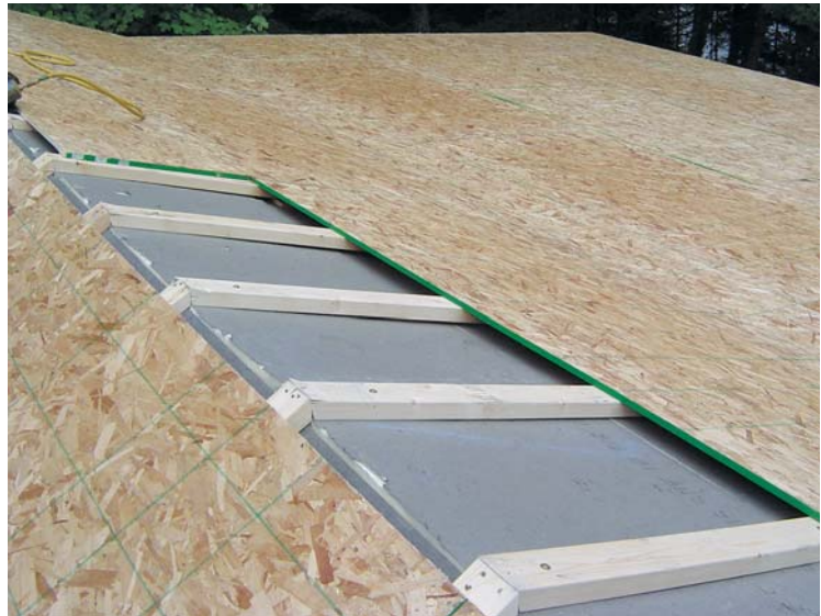
Figure 3. The roof sheathing is fastened to the 2x4 spacers, creating a 1½-inch vent channel above the rigid foam insulation (left). The sheathing stops short of the peak to allow airflow through the ridge vent (above).

Sheathing. We nail the spacers to the purlins or — on roofs with a single layer of rigid foam — secure them to the rafters or decking below with screws. We then sheathe the new roof surface with 5/8-inch CDX plywood, stopping it short of the ridge so that the roof can vent to a ridge cap ( Figure 3 ).