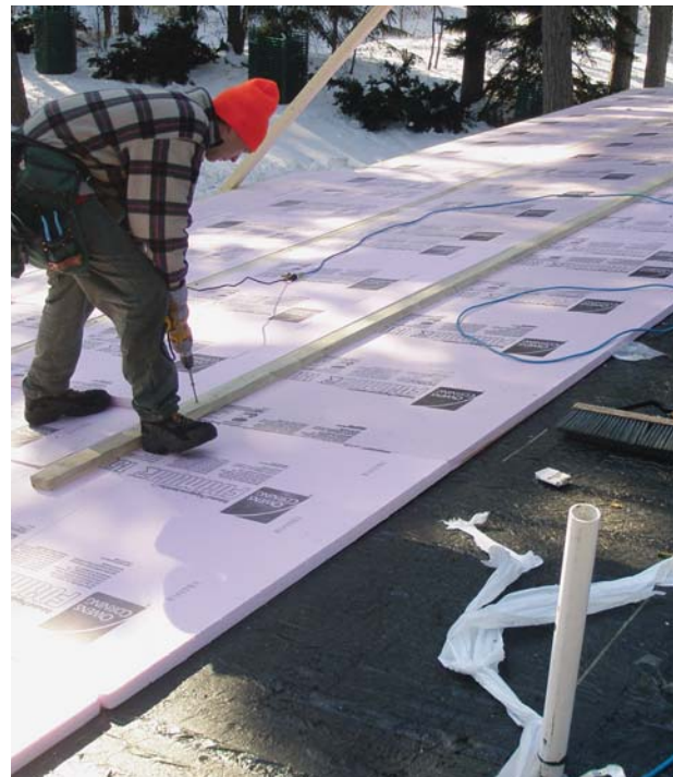
Figure 1. After installing a double 2x4 nailer around the perimeter of the roof, the crew fills in the field with a layer of 1½-inch rigid foam (above). A second layer is installed over the first, with 2x4 purlins between each row to provide nailing for the spacers to follow (right).