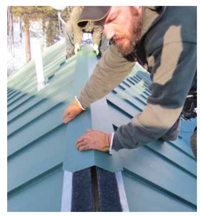
Ridge cap is applied by sliding it onto the vent assembly.