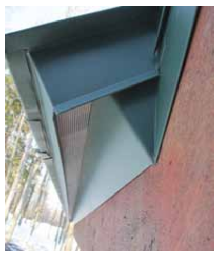
Eave venting applied over existing roof deck.

Admittedly, this is an expensive seven-piece system that amounts to approximately $7.50 per linear foot in materials. But we have arrived at it over decades of struggling with the conse-